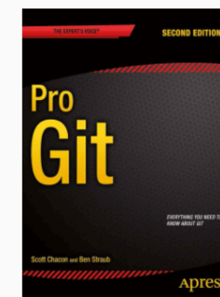
2nd Edition (2014)